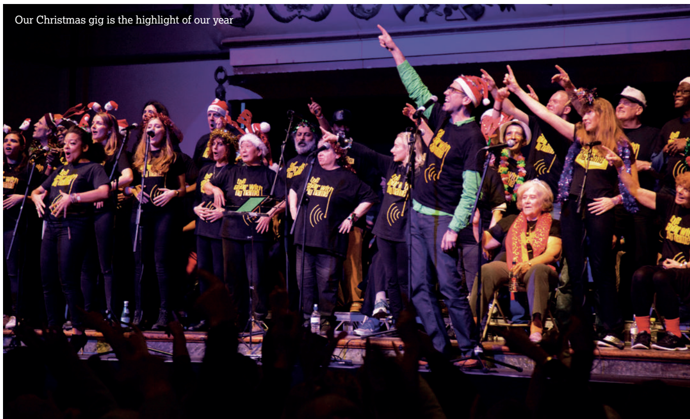
Our Christmas gig is the highlight of our year

Our gigs are important, for a number of reasons. Firstly, it gives members the chance to experience the thrill of thunderous applause and standing ovations, which can restore a sense of pride and self-worth. Secondly, it demonstrates to the wider public the amazing things our members can achieve.