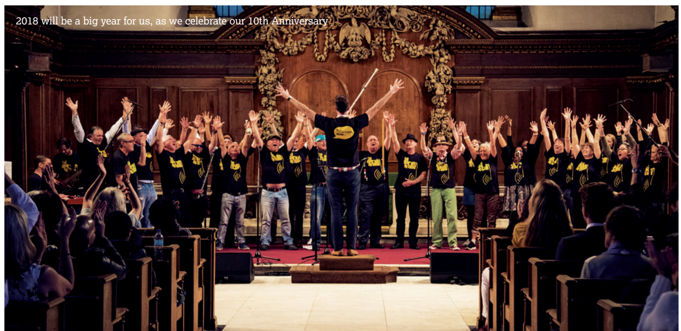
2018 will be a big year for us, as we celebrate our 10th Anniversary