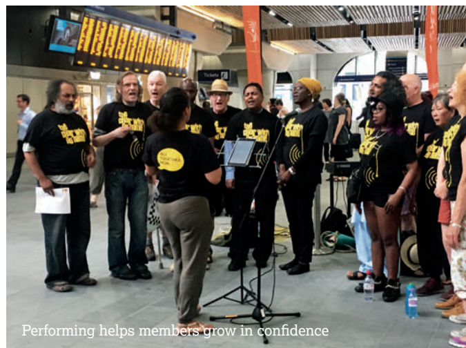
Performing helps members grow in confidence

Our members love performing live, so we ensured that our choir gigs were spread over a wide variety of settings, from those that help members feel they're giving something back to society (such as performances at local older people's services), to thrilling, aspirational events that help build confidence and give us all something to look forward to. Our four choirs performed a whopping 51 gigs between them, collectively reaching over 15,000 people across the UK. Highlights