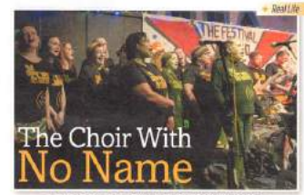
Through the compelling power of music and compassion, a Birmingham choir is giving new faces to people who have very few.